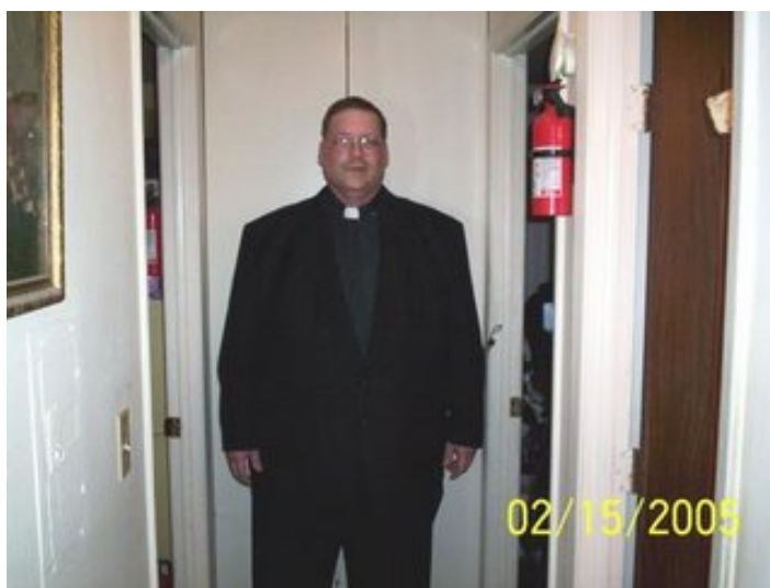
Me a couple of years ago:

“Couldn’t be disabled and in the Navy” This one pretty harshly insults the many thousands of brave men and women in the US Armed Forces who, despite various disabilities, continue to serve and protect their country, going into harm’s way on a daily basis. Having a disability does not automatically make anyone ineligible for military duty, it depends on the type and extent of disability and one’s specialty. The critics making this claim are woefully ignorant of military protocols. I will not discuss my own medical history here, because I believe it’s not appropriate to be in the public domain. One person stole part of my current medical history from a very private discussion group, this is being dealt with. I have multiple disabilities, that’s all anyone needs to know.